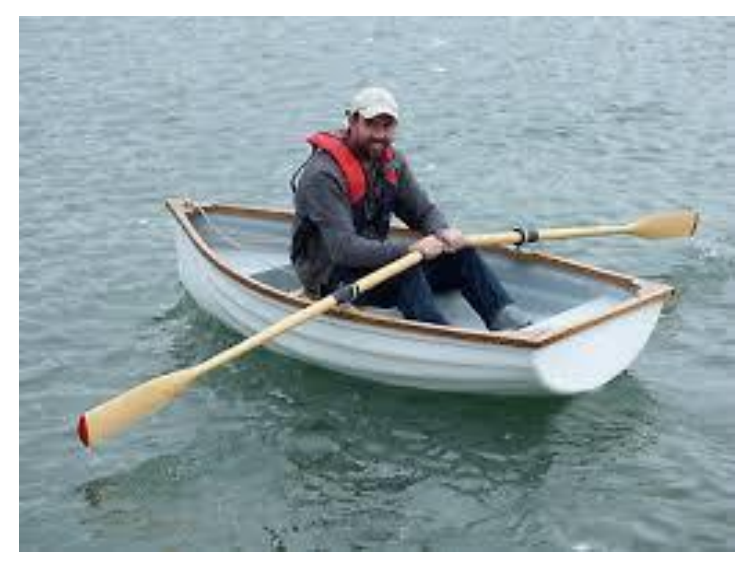
Row, row, row your boat Gently down the stream Merrily, merrily, merrily, merrily Life is but a dream.

Row, row, row your boat Gently down the stream If you see a crocodile don't forget to scream!!!!!.