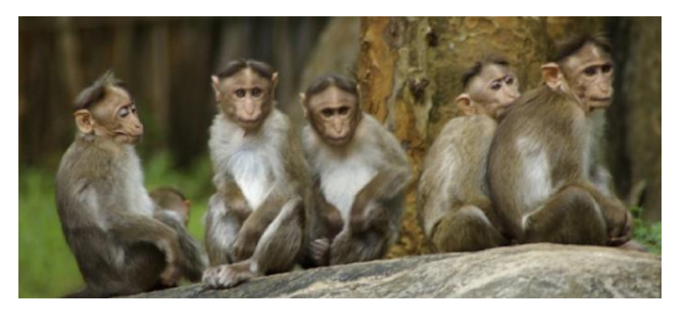
5 little monkeys jumping on the bed, 1 fell down and bumped his head, Mummy called the doctor and the doctor said, "No more monkeys, jumping on the bed!"